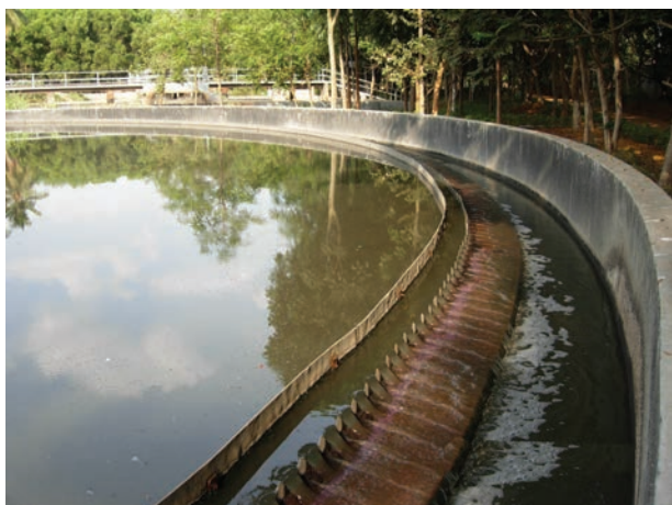
Fig. 18.5 Water clarifier

a scraper. This is the sludge . A skimmer removes the floatable solids like oil and grease. Water so cleared is called clarified water (Fig. 18.5).