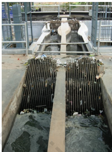
Fig. 18.3 Bar screen