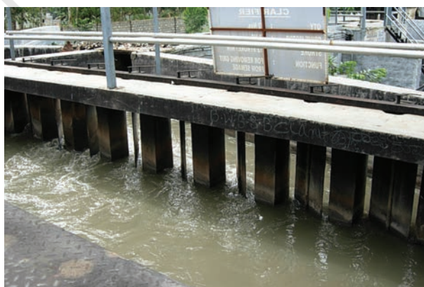
Fig. 18.4 Grit and sand removal tank