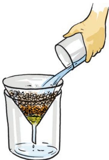
Fig. 18.2 Filtration process