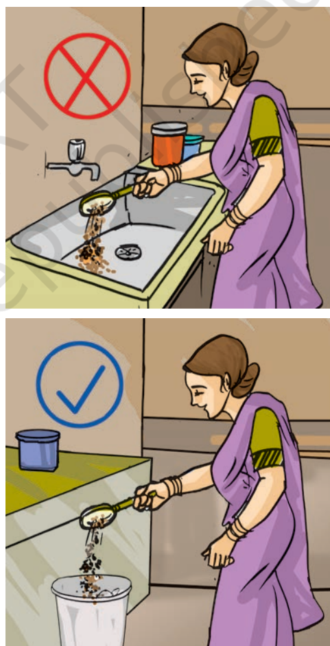
Fig. 18.7 Do not throw everything in the sink