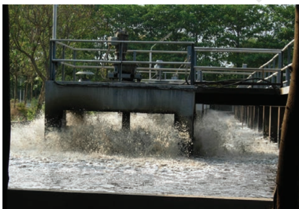
Fig. 18.6 Aerator

4. Air is pumped into the clarified water to help aerobic bacteria to grow. Bacteria consume human waste, food waste, soaps and other unwanted matter still remaining in clarified water (Fig. 18.6).